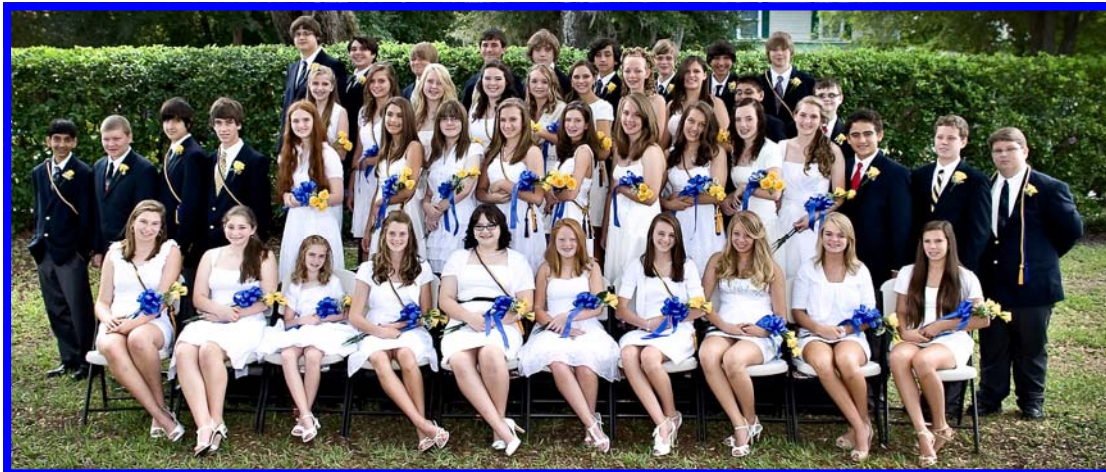
Class of 2011 Forty-Five 8th Grade Graduates

Our Tennis Team won the Volusia County Middle School Junior Team Championship. The St. Barnabas' Tennis Team beat out 7 Volusia County Middle Schools to become the 2011 champions. Since 2008, the Tennis Team has won 3 other USTA Championships.